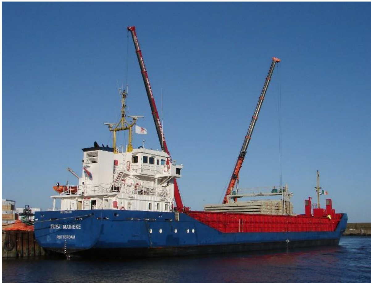
Alongside and ready