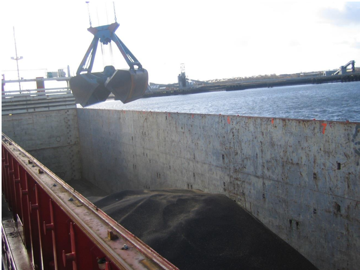
Discharging a cargo of rapeseed in bulk.