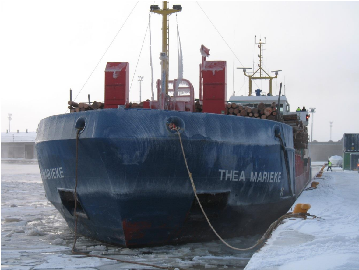
A cold day at work