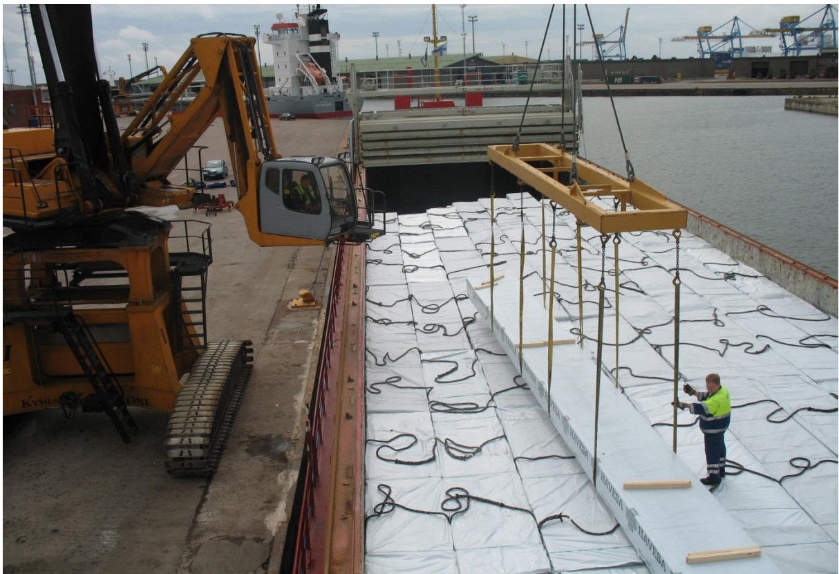
Loading sawn timber and gluelam in Finland