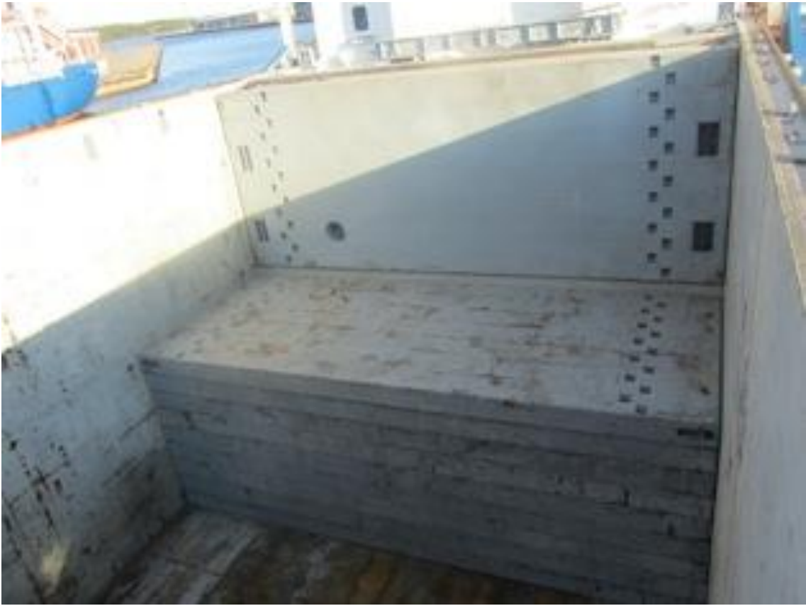
Pontoons stacked aft