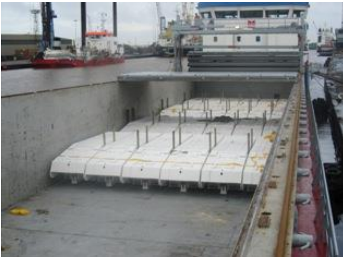
Some cargo on the tweendeck