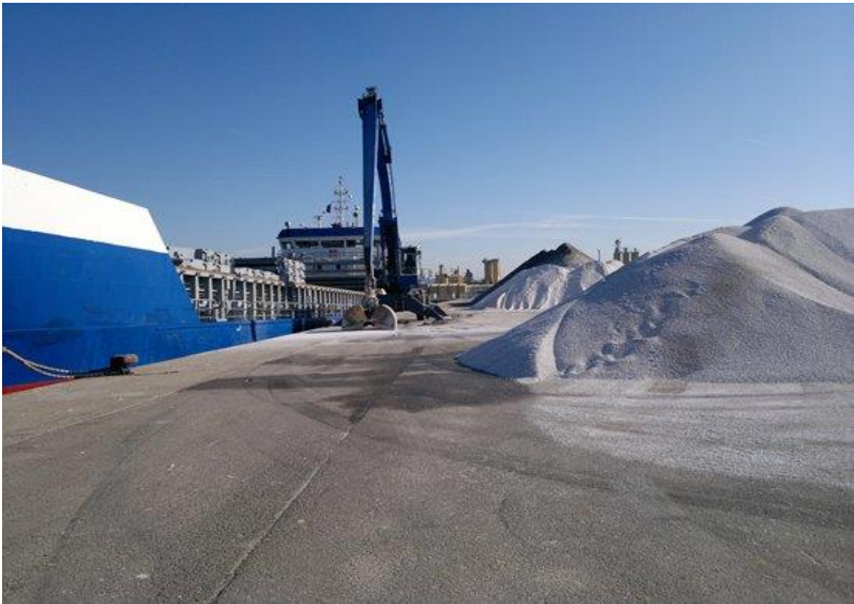
Also bulk cargoes