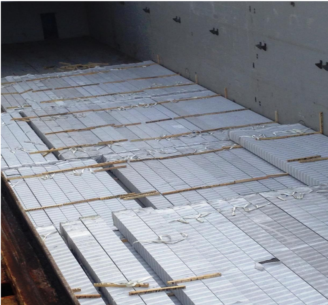
Loading steel in Turkey